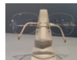
Lens Shape: 'Classic'