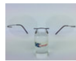
Lens Shape: 'Cosmo'