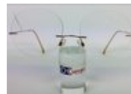
Lens Shape: 'Cue Ball'