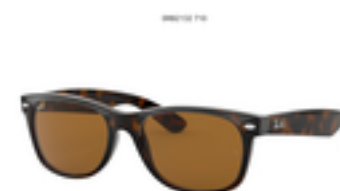
RayBan Frame: 2132 (New Wayfarer) Color: 710 (Light Havana)