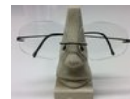
Lens Shape: 'Sport'