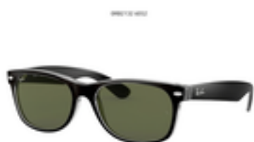
RayBan Frame: 2132 (New Wayfarer) Color: 6052 (Black/Transparent)

(RayBan Promo: We will discuss colors and sizes after we receive your online order and call you to discuss your selection)