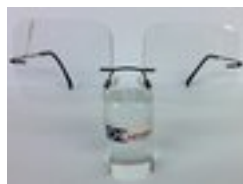
Lens Shape: 'Angles'