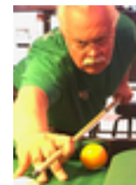
Shoots Left Handed