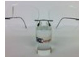
Lens Shape: 'Diamond'