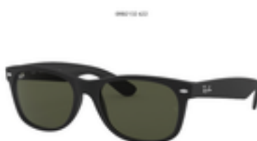
RayBan Frame: 2132 (New Wayfarer) Color: 622 (Rubber Black)