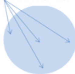
Single Vision Lens